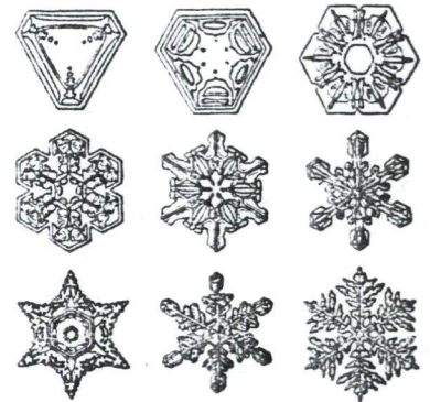
Crystals of Snow (greatly magnified).